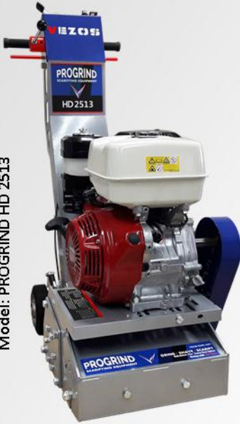
Model: PROGRIND HD 2513

PROGRIND HD walk-behind scarifiers cover a large series of surface preparation applications, designed only for professional use due to their heavy-duty structure and high speed cutting technology.