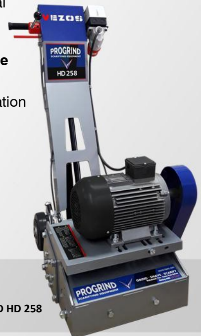
Model: PROGRIND HD 258