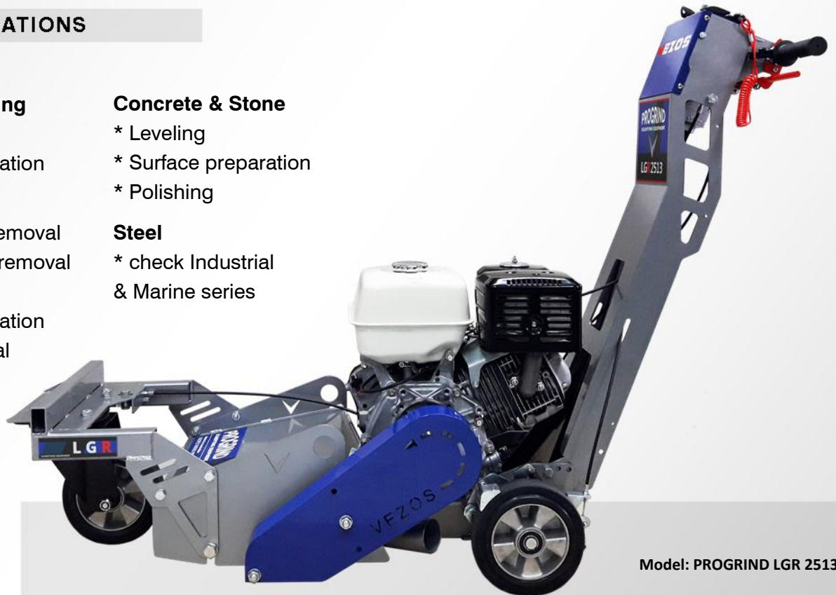
Model: PROGRIND LGR 2513