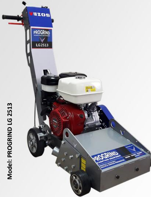
Model: PROGRIND LG 2513